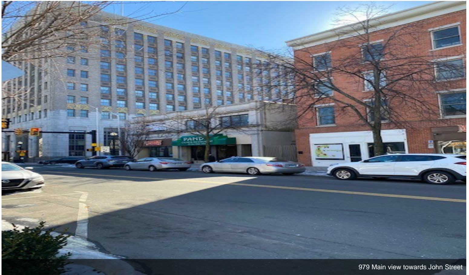
979 Main view towards John Street