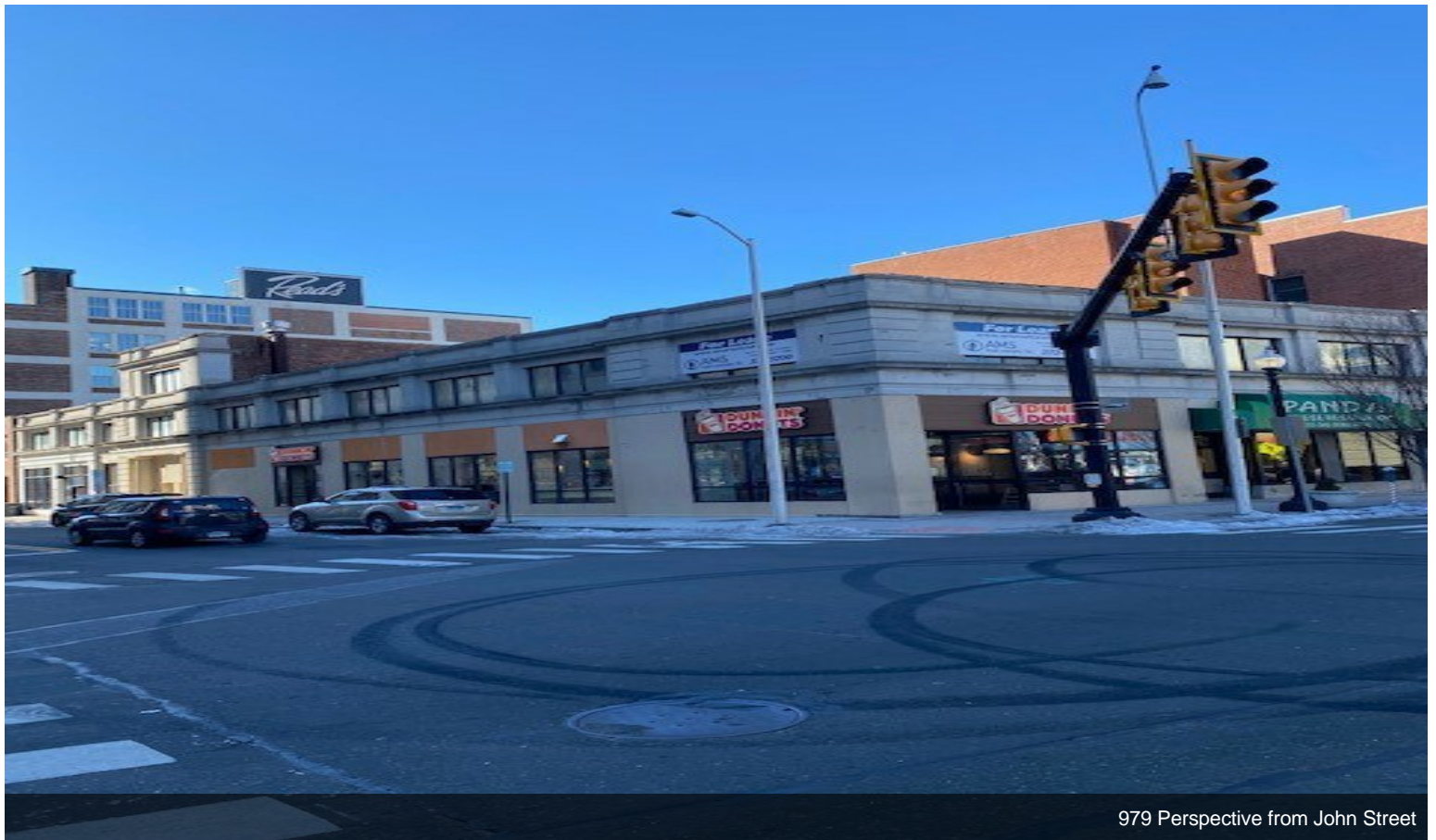
979 Perspective from John Street